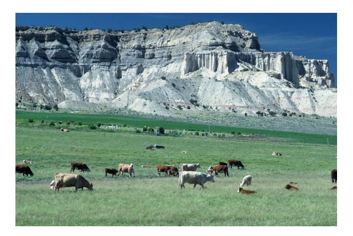
Utah Department of Agriculture & Food

Mission: "Improving the productivity and sustainability of our rangelands and watersheds."